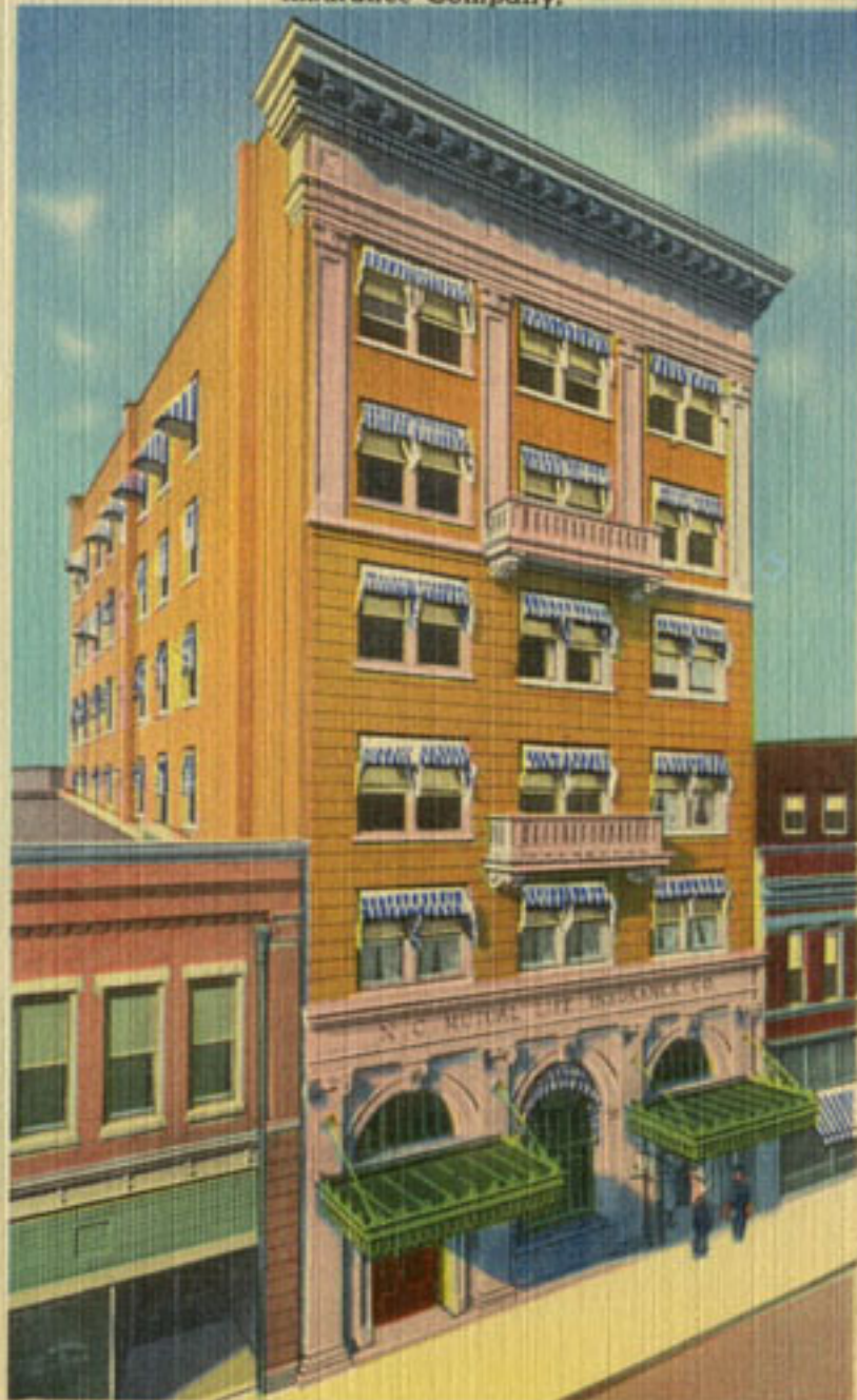
Durham, North Carolina