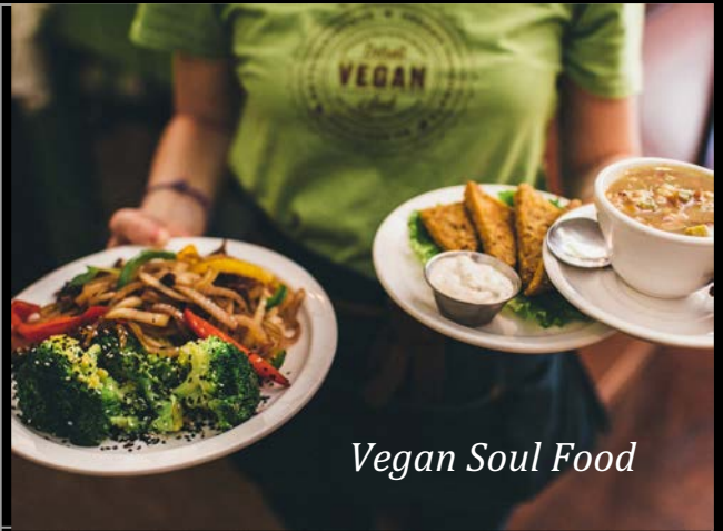
Vegan Soul Food