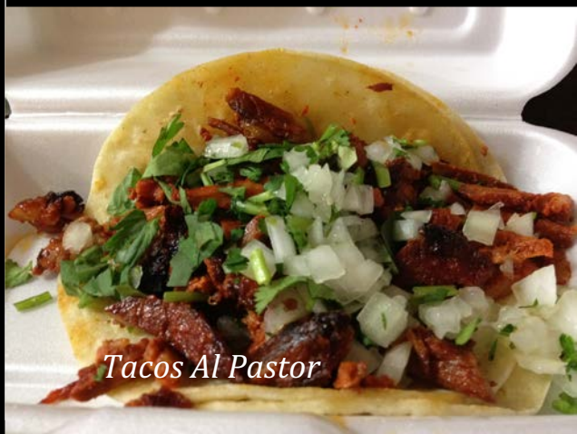
Tacos Al Pastor