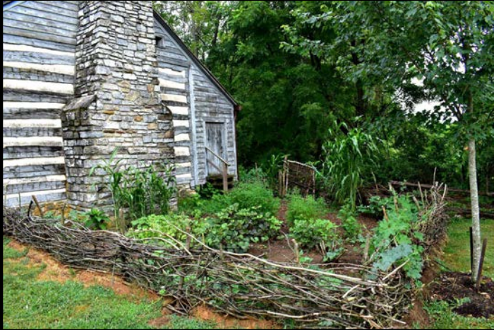
Recreated slave garden.