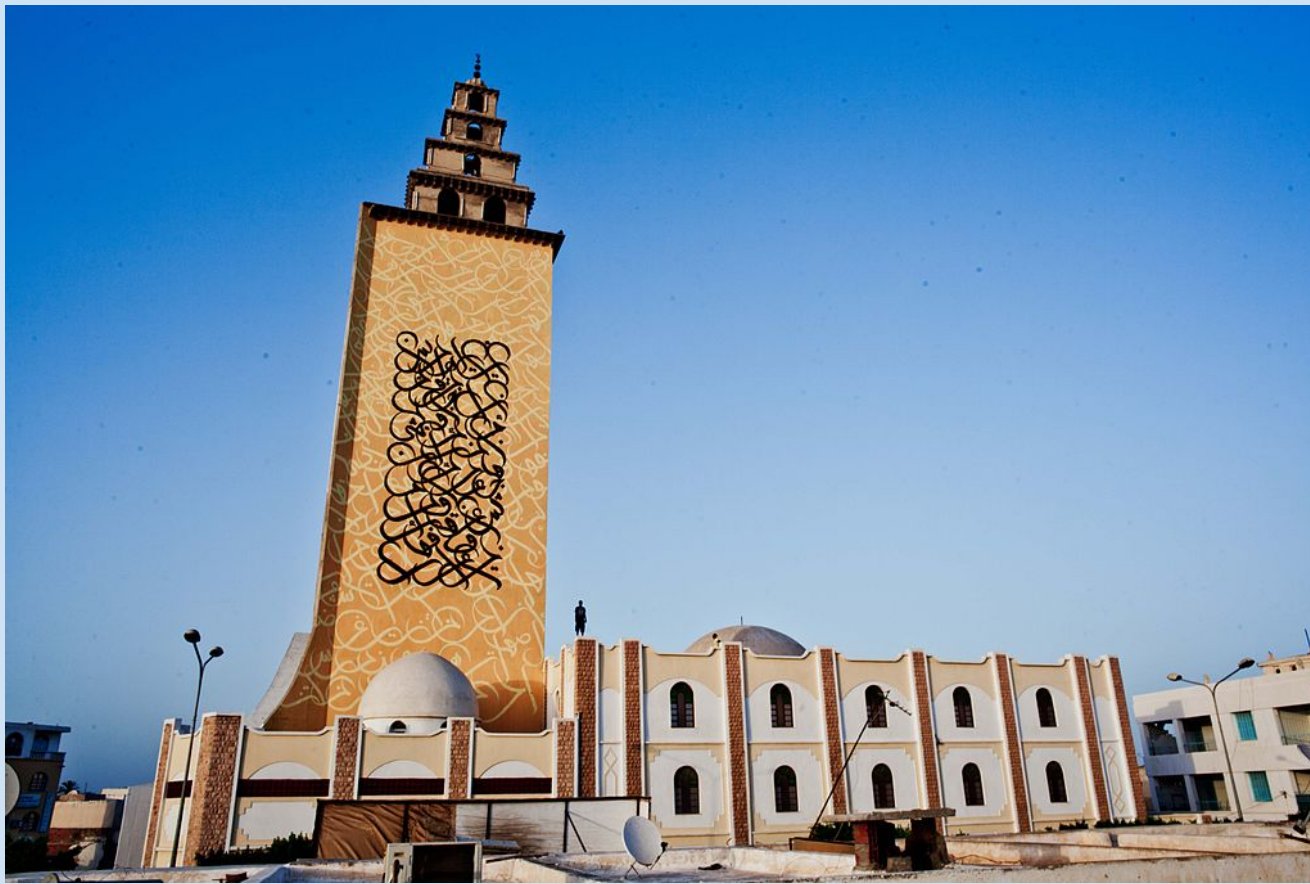
Jara Mosque in Gabes, Tunisia, 2012

"Oh humankind, we have created you from a male and a female and made people and tribes so you may know each other,"