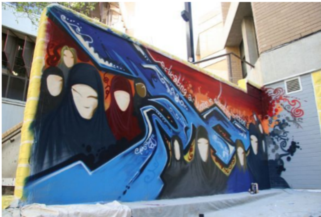
Melbourne Australia - 'Knowledge - Educating a Woman is Educating a Nation'