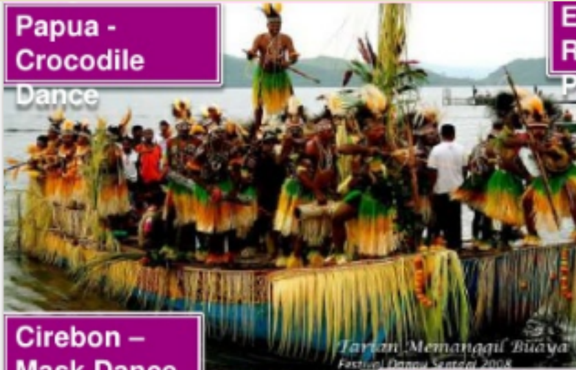
Papua - Crocodile Dance