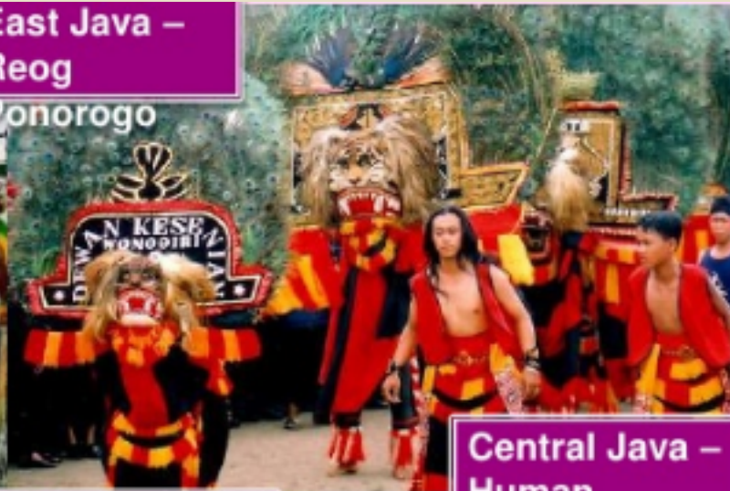
East Java - Reog Ponorogo