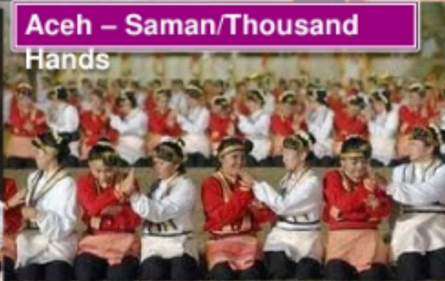
Aceh - Saman/Thousand Hands