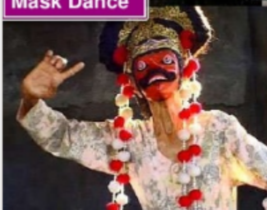
Cirebon - Mask Dance