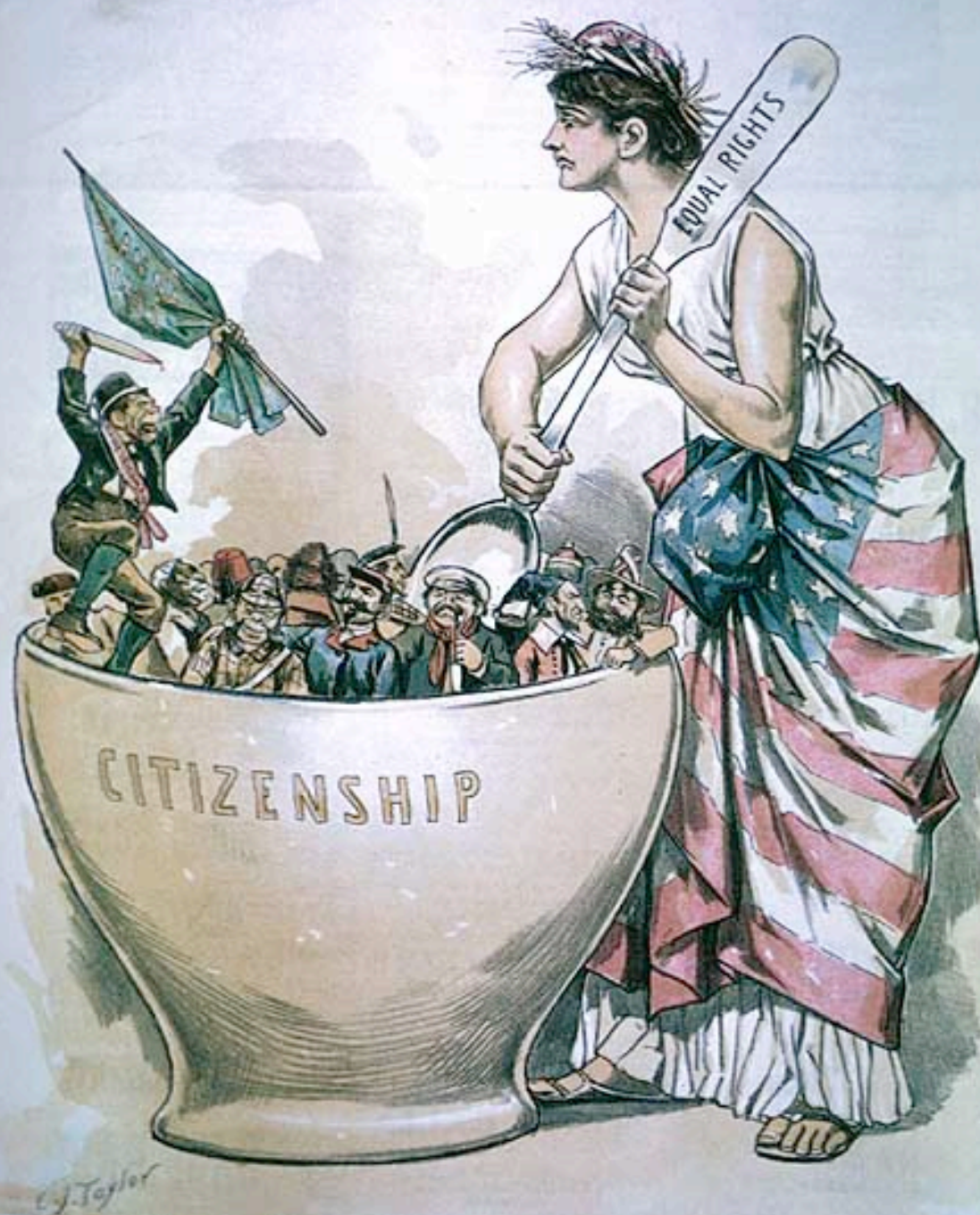
THE MORTAR OF ASSIMILATION—AND THE ONE ELEMENT THAT WON'T MIX.