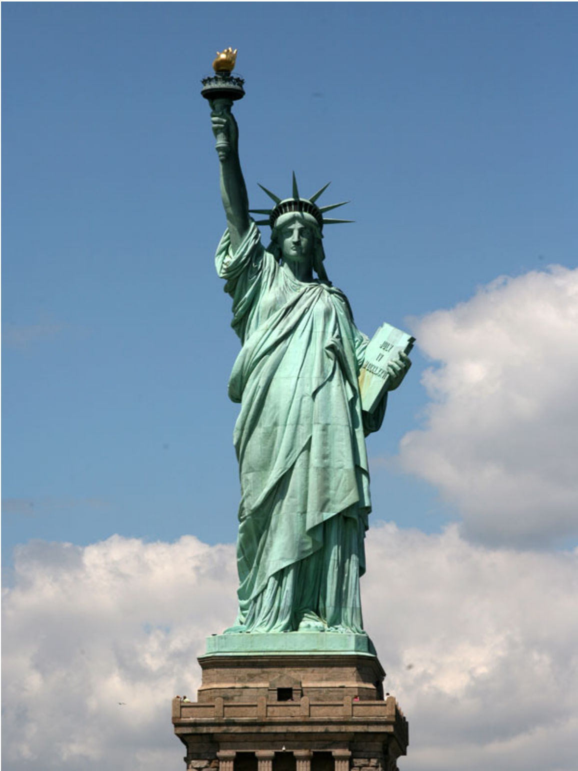
Image: The Statue of Liberty