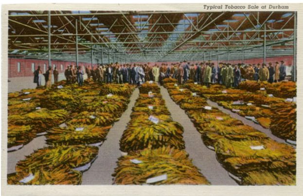
Postcard of Typical Tobacco Sale at Durham

Despite the diversions outside the warehouse, the auction was the main event and dominated the downtown scene. This was the time when the anxious farmer would find out what he would be paid for the culmination of his year of hard work. Tobacco auctions were more than just a sale – they were exciting, festive affairs. With the tobacco lined up row by row in the warehouses, warehousemen, buyers, sellers, speculators and the auctioneers, would crowd around to observe and/or participate in the fast paced bidding.