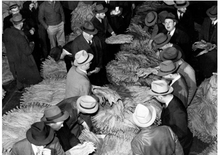
Auctioneer, buyers, and farmers during tobacco auction Durham, NC, 1939."

Auctioneers needed incredible skill and focus. The faster the auctioneer could chant, the faster the tobacco would be sold. While chanting out prices, the auctioneer had to also intently watch buyers' body language. Particular signals (a slight hand gesture, a nod, etc.), often small and secretive since buyers didn't want others to know who was bidding, meant that the person agreed to the price. The auctioneer's job was to quickly raise the price to see if anyone would bid higher. If not, the auctioneer would yell out "Sold!" and move on to the next pile of tobacco, beginning the process again. Other warehouse staff, such as ticket markers, bookmen and clipmen would record prices, pounds purchased, buyers names, etc.