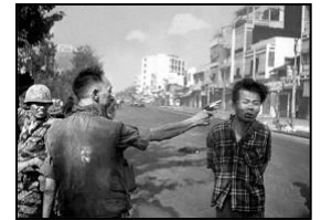
“General Nguyen Ngoc Loan executing a Viet Cong prisoner in Saigon” Famous Tet Offensive

Nonetheless, Nixon promoted a policy of Vietnamization of the war, promising to withdraw U.S. troops gradually and hand over management of the war effort to the South Vietnamese. Although Nixon made good on his promise, he also illegally expanded the geographic scope of the war by authorizing the bombing of Viet Cong sites in the neutral nations of Cambodia and Laos , all without the knowledge or consent of the U.S. Congress. The revelation of these illegal actions, along with the publication of the secret Pentagon Papers in US newspapers in 1971, caused an enormous scandal in the United States and forced Nixon to push for a peace settlement. These papers revealed that the U.S. Army, as well as presidents Truman, Eisenhower, Kennedy, and Johnson, had authorized a number of covert actions that increased U.S. involvement in Vietnam unbeknownst to the American public. The government tried to block the publication of these papers under the guise of “national security”, but the Supreme Court ruled in New York Times v. US that the government must prove an immediate threat to national security to censor the papers.