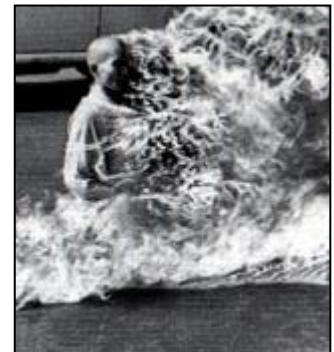
Self – Immolation

At this point, the United States' Cold War foreign policy began to play a major part in Vietnam. U.S. policy at the time was dominated by the domino theory , which believed that the "fall" of North Vietnam to Communism might trigger all of Southeast Asia to fall, setting off a sort of Communist chain reaction. Within a year of the Geneva Accords, the United States therefore began to offer support to the anti-Communist politician Ngo Dinh Diem . With U.S. assistance, Diem took control of the South Vietnamese government in 1955 and declared the Republic of Vietnam. Due to the popularity of Ho Chi Minh throughout Vietnam, Diem promptly canceled the elections that had been scheduled for 1956.