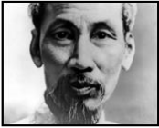
Ho Chi Minh

During World War II, when France was occupied by Nazi Germany, it lost its foothold in Vietnam, and Japan took control of the country. The Viet Minh resisted these Japanese oppressors and extended its power base throughout Vietnam. When Japan surrendered at the end of World War II in 1945, Ho Chi Minh's forces took the capital of Hanoi and declared Vietnam to be an independent country, the Democratic Republic of Vietnam .