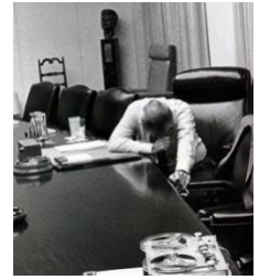
Vietnam takes its toll on President Johnson

Kennedy's successor, Lyndon B. Johnson , pledged to honor Kennedy's commitments but hoped to keep U.S. involvement in Vietnam to a minimum. He kept Kennedy's Secretary of Defense, Robert McNamara , but replaced the previous American military commander with William C. Westmoreland – a U.S. general who advocated aggressive strategies against Viet Cong and NVA using large numbers of U.S. forces. After North Vietnamese forces allegedly attacked U.S. Navy ships during the Gulf of Tonkin Incident in 1964, Johnson was given carte blanche in the form of the Gulf of Tonkin Resolution . This resolution allowed Johnson "to take all necessary measure to repel any armed attack against the forces of United States and to prevent further aggression;" this greatly expanded his presidential power. With the free hand recently provided by Congress, Johnson ordered the U.S. Air Force and U.S. Navy to begin an intense series of air strikes called Operation Rolling Thunder . He hoped that the bombing campaign would demonstrate to the South Vietnamese the U.S. commitment to their cause and its resolve to halt the spread of Communism. Ironically, the air raids seemed only to increase the number of Viet Cong and NVA (North Vietnamese Army) attacks. Johnson's "Americanization" of the war led to a presence of nearly 400,000 U.S. troops in Vietnam by the end of 1966.