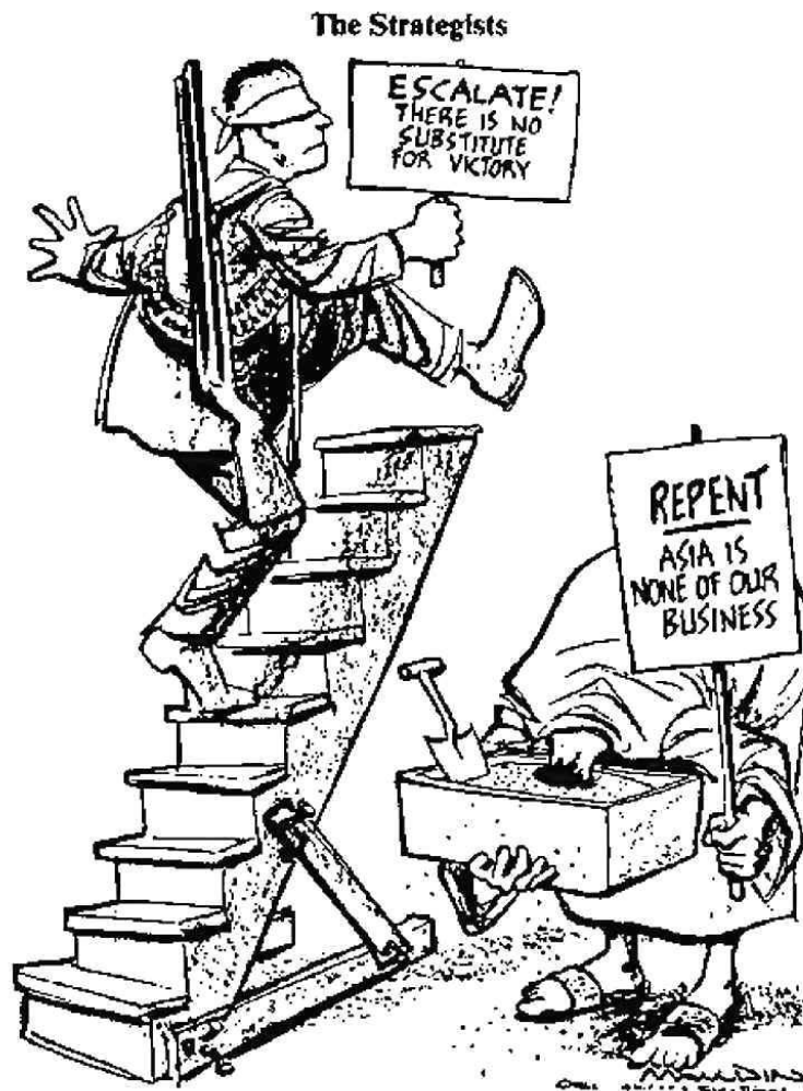
Bill Mauldin. The Sun-Times (Chicago), 1966.