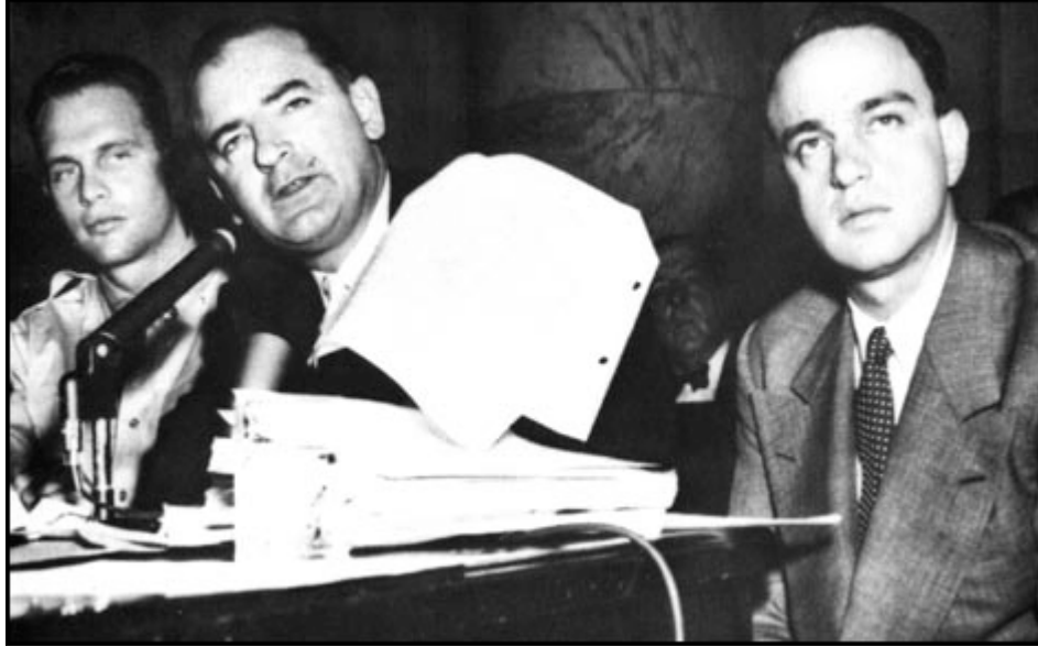
Senator Joseph McCarthy (center) at a hearing