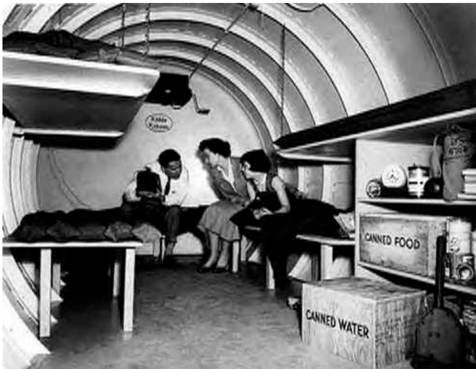
Family in a fallout shelter during the Cuban Missile Crisis