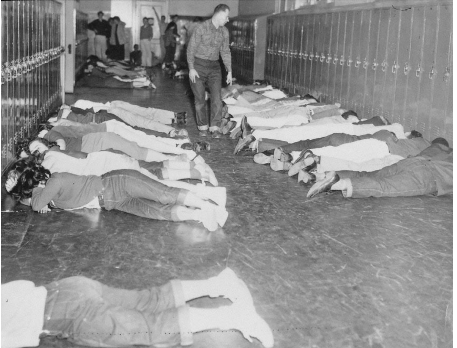
Lincoln High School Air-Raid Drill, 1950