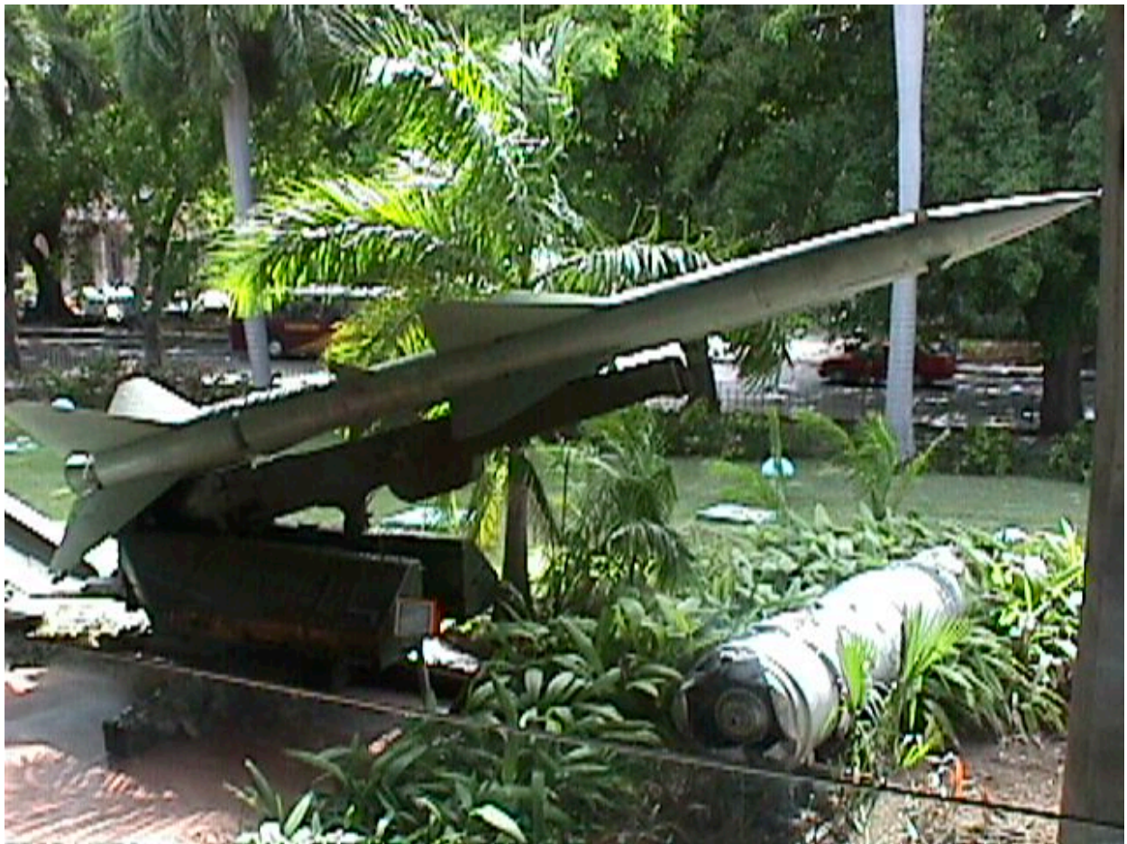
Long-range surface-to-air missile in Cuba