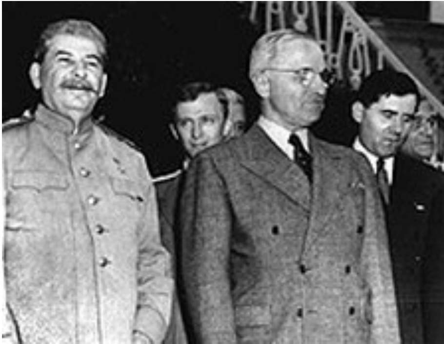
Joseph Stalin and Harry Truman at Potsdam