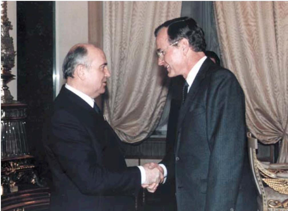
U.S. President George Bush with Mikhail Gorbachev of the Soviet Union