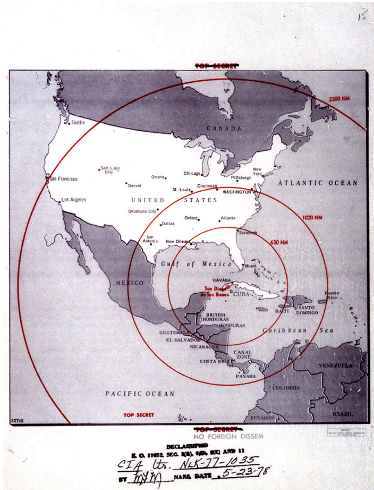
Top secret document demonstrating the range of missiles from Cuba