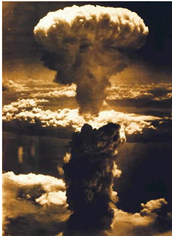
The bombing of Nagasaki, Japan, which killed 80,000 people