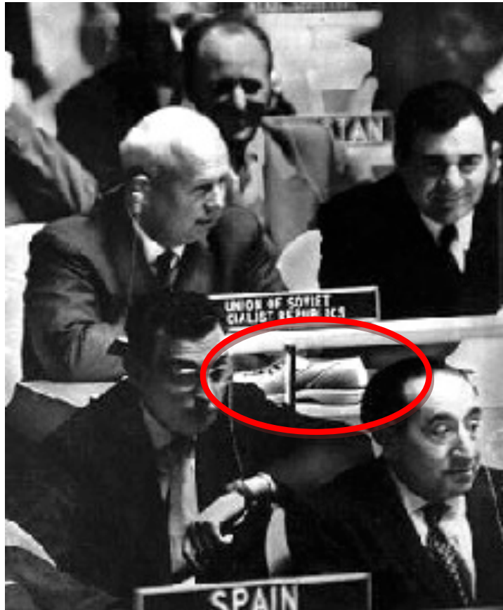
Khrushchev and his shoe: